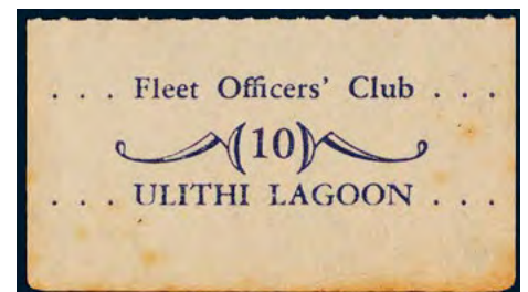
10 cent chit. Design B.