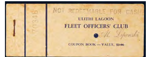
Coupon book cover.