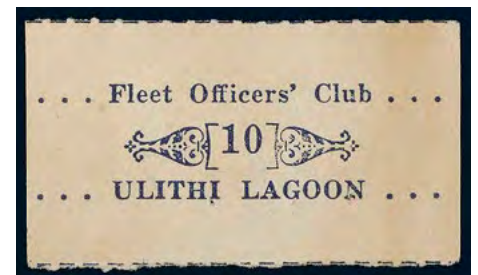
10 cent chit. Design A.