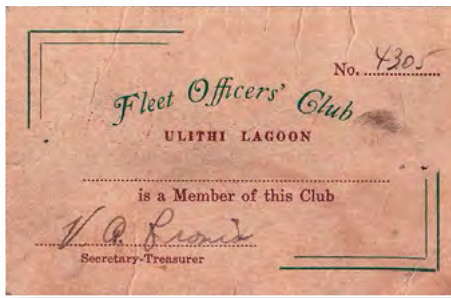
Fleet Officers' Club Card.

A membership card, costing one dollar, was required to purchase books of chits to exchange for beverages at the Fleet Officers' Club.